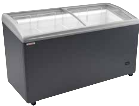
RIO S 150