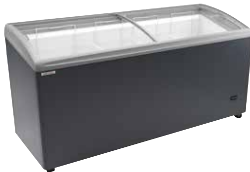
RIO S 175