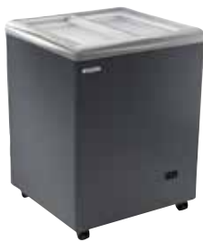
RIO H 68