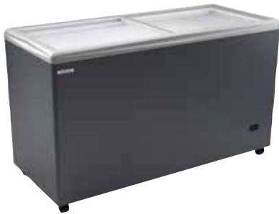
RIO H 150