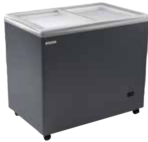
RIO H 100