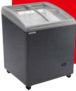
RIO S 68

RIO can be served from both sides and is the ideal solution for every area because of different size variants.