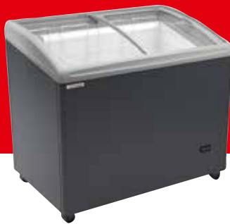
RIO S 100