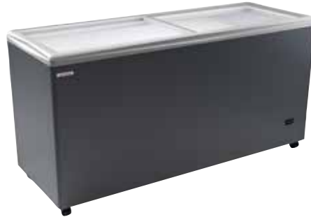
RIO H 175