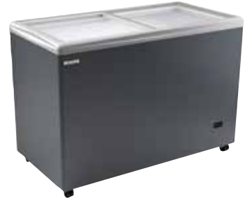
RIO H 125