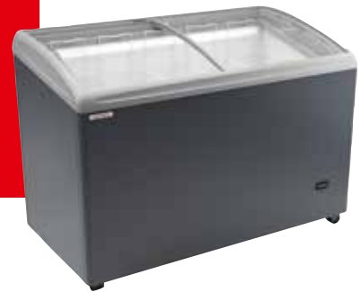
RIO S 125